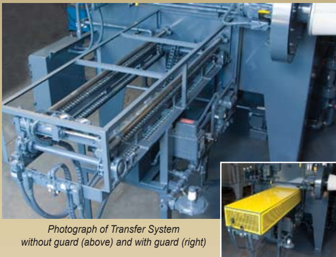
Photograph of Transfer System without guard (above) and with guard (right)

Beaver Tails are unique basket attachments used in conjunction with Rams to transfer loads within a furnace. This BeaverMatic trade secret design makes its system extremely reliable for controlling the load.