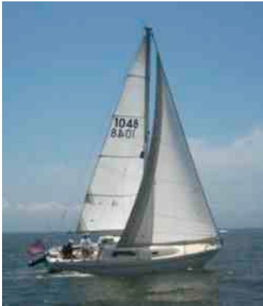
Inspirit wins the July Fun Buoy Race

Refer to our event calendar on our website at www.essexcyc.org for event details!