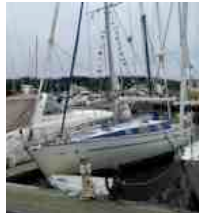
We made it! Bluebird docked at RNSYS