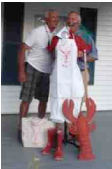
Annual Labor Day Weekend Lobster Bake