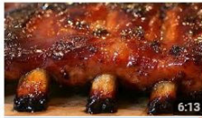
Baby Back Ribs ~ Pressure Cooker Recipe ~ Noreen's ...