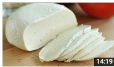
How To Make Mozzarella Cheese ~ Mozzarella Cheese Recipe ~...