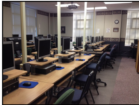
ABOVE: The large computer lab in Room 310 at StoneGate Center is home to a number of Ivy Tech classes.