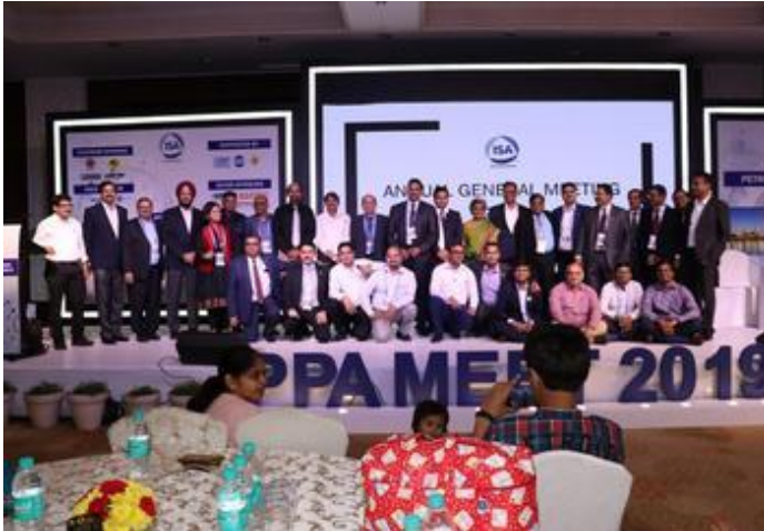
Executive Board Members at AGM