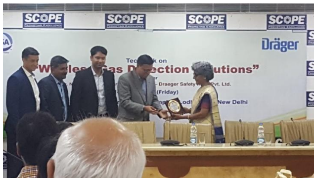
Felicitation by ISA – D President to the team Dräger Safety India Pvt. Ltd.