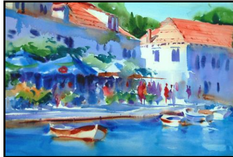
Cavtat Harbor Walk