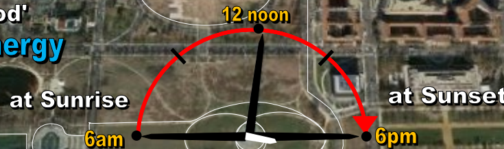
The Mall A 'gestation' of time