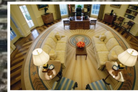
THE 'OVAL' OFFICE Union of Fertility

This illustration suggests that the male member motif is an esoteric encryption of the attempt by the Luciferians to resurrect their coming 'Nimrod' or AntiChrist savior.