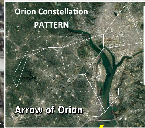
Orion Constellation PATTERN