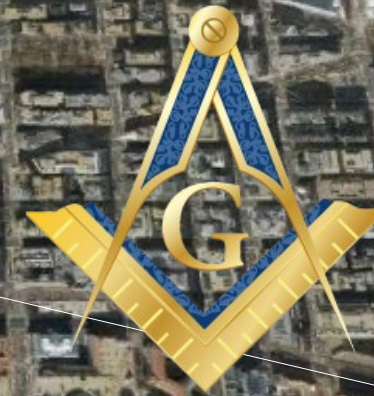
'Semiramis' Female Energy