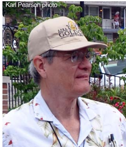
Karl Pearson photo