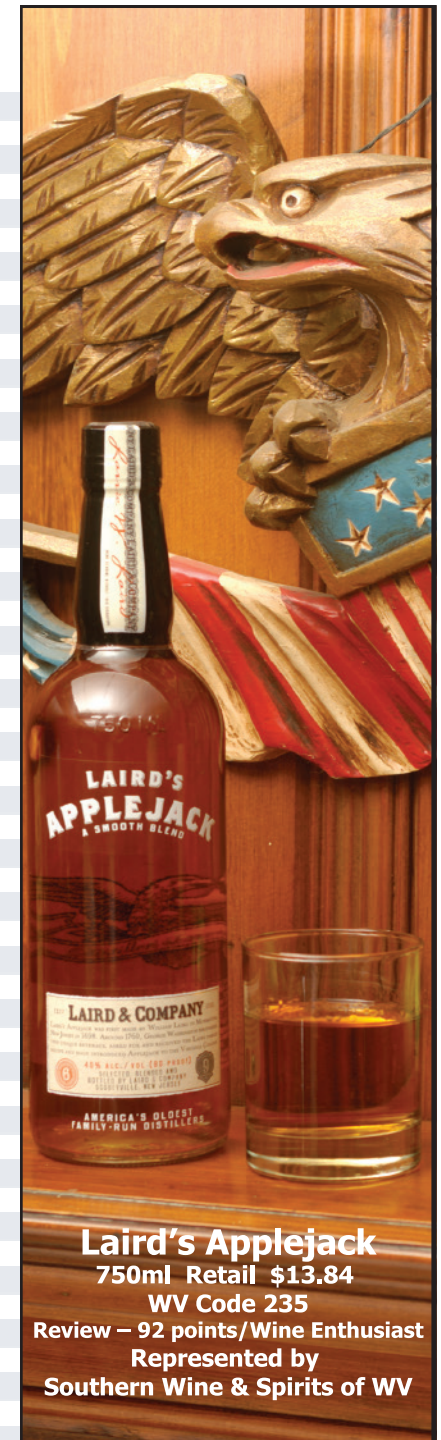
Laird's Applejack 750ml Retail $13.84 WV Code 235 Review – 92 points/Wine Enthusiast Represented by Southern Wine & Spirits of WV