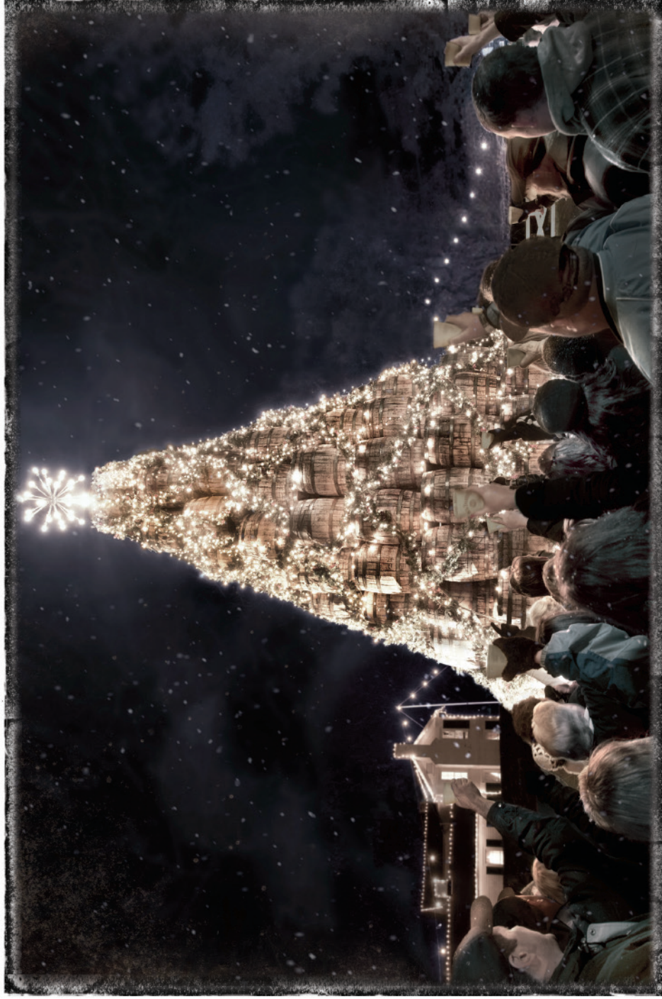
The Barrel Tree in Lynchburg, Tennessee. All 140 barrels of it.