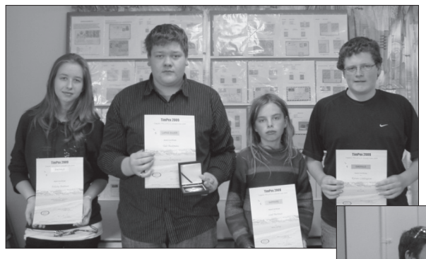
City of Sails Junior Stamp Club