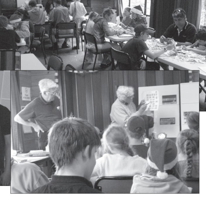
Ashhurst Junior Stamp Club