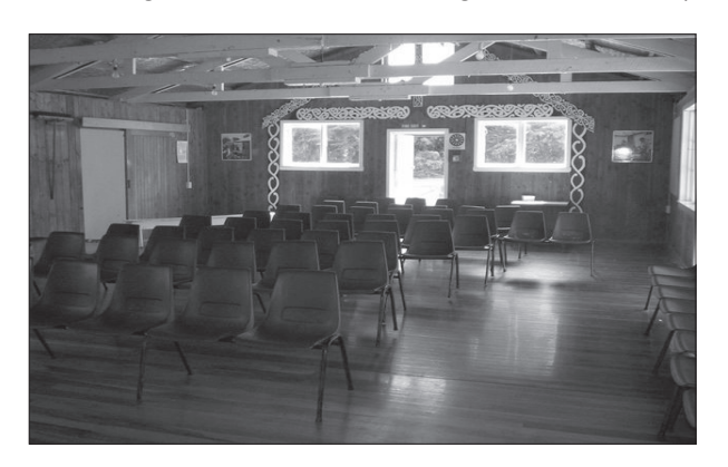
Interior of the Maire Lodge, where the project work will be done.

Activities will be typical of the well-established PYC National Stamp Camp style. Each camper will undertake a camp project that will be judged towards the end of the camp. Many experienced leaders will be present to pass on their skills, encouragement and knowledge to all campers.