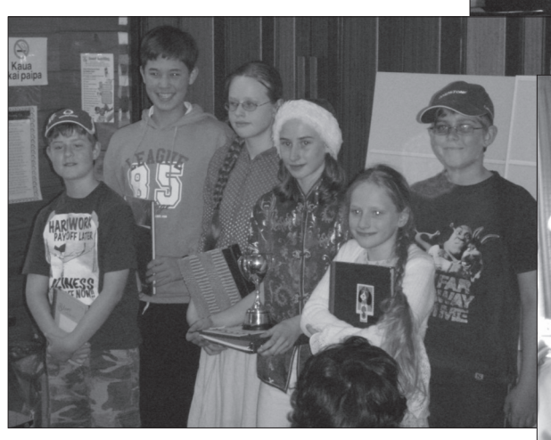
Christchurch Junior Stamp Club