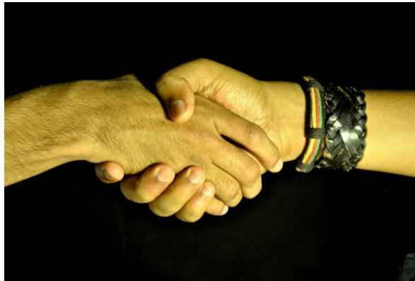
Shaking hands is usually a sign of friendship or agreement, often used when saluting someone. It is symbolic for Jesus' work on the cross to pay for our sins and reconcile us to God.

In Meriam Webster's dictionary the word reconciliation means: the act of causing two people or groups to become friendly again after an argument or disagreement . In the same dictionary the word ambassador means: the highest-ranking person who represents his or her own government while living in another country . The Bible uses these two words this way: 2 Corinthians 5:18-21:18 And all things are of God, who hath reconciled us to himself by Jesus Christ, and hath given to us the ministry of reconciliation; 19 To wit, that God was in Christ, reconciling the world unto himself, not imputing their trespasses unto them; and hath committed unto us the word of reconciliation. 20 Now then we are ambassadors for Christ, as though God did beseech you by us: we pray you in Christ's stead, be ye reconciled to God. 21 For he hath made him to be sin for us, who knew no sin; that we might be made the righteousness of God in him.