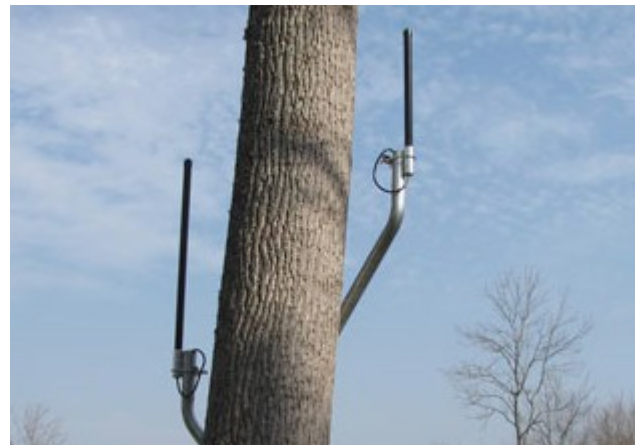
Figure 3. Omnidirectional Antenna

The directional antenna must be mounted so that the main beam of the antenna is parallel to the ground and pointed in the direction of the transmitting/receiving device (see Figure 2). The omnidirectional antenna should be mounted perpendicular to the ground (see Figure 1).