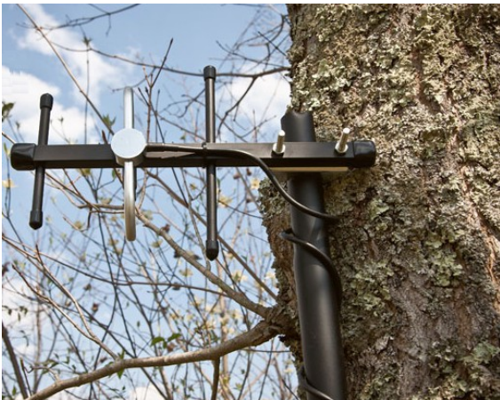
Figure 2. Directional (Yagi) Antenna

For areas where it is difficult to get a good signal, a high gain directional antenna (Yagi) is generally the best choice. The only limitation with directional antennas is that they are not suitable for devices used as repeaters. This is due to the fact that they must be pointed in the direction of the device they will be communicating with. A repeater must communicate with more than one device, therefore a directional antenna is not a good choice for a device that will be used as a repeater.