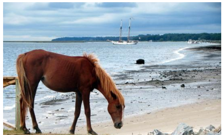
Wild horse grazing on the beach of Cumberland Island.

Relatively untouched by civilization, this 18-mile stretch of beach might be home to more wild horses than people. Only accessible by a 45-minute ferry ride, visitors can camp beneath the oak trees or wander around the ruins of grand mansions that once stood along the shore. "The island is truly amazing," noted one visitor. "Magical, even."