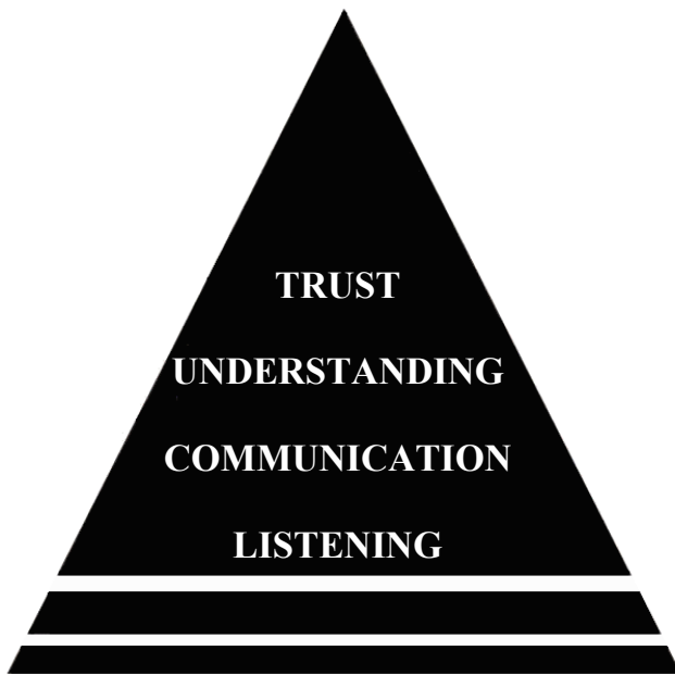
HOW RELATIONSHIPS DEVELOP