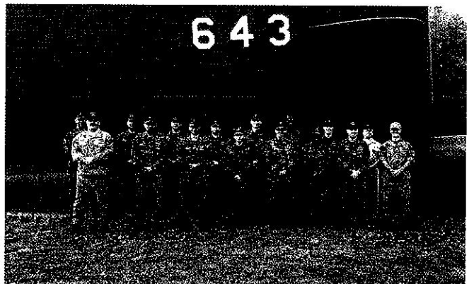
Members of SSGN CMAV LANT, SUBLANT UWO 1 and CTF 69 UWO ATL at Naval Submarine Base Kings Bay.