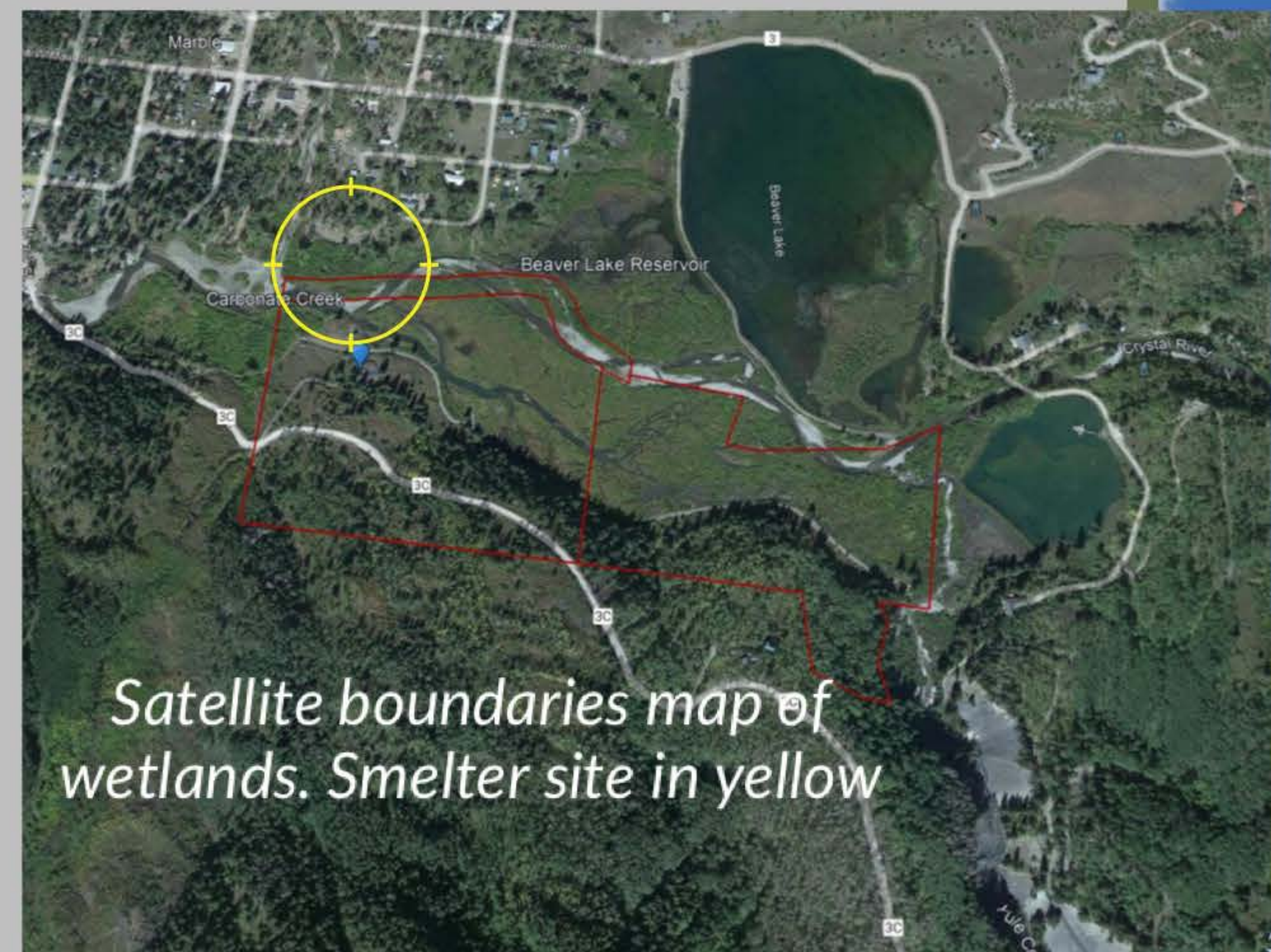
Satellite boundaries map of wetlands. Smelter site in yellow

Among a few old mining structures, a large mound of stony matter containing unhealthy amounts of arsenic and lead is what remains of the operation. The site is a part of a 54-acre landholding now known as the Marble Wetland Preserve, once named the Hepola Wetlands, donated to the Aspen Valley Land Trust by Pamela Hepola to be restored, protected, and preserved in perpetuity. The wetland spans both sides of the Crystal River from Carbonate Creek to Yule Creek. The slag pile sits on the west end with access from county road 3. The Crystal River flows less than 100 feet from the toe of the slag a pile with a difference of 20 vertical feet in elevation to its peak.