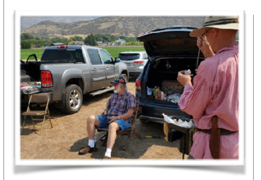
Two Dogs and Lone E1K