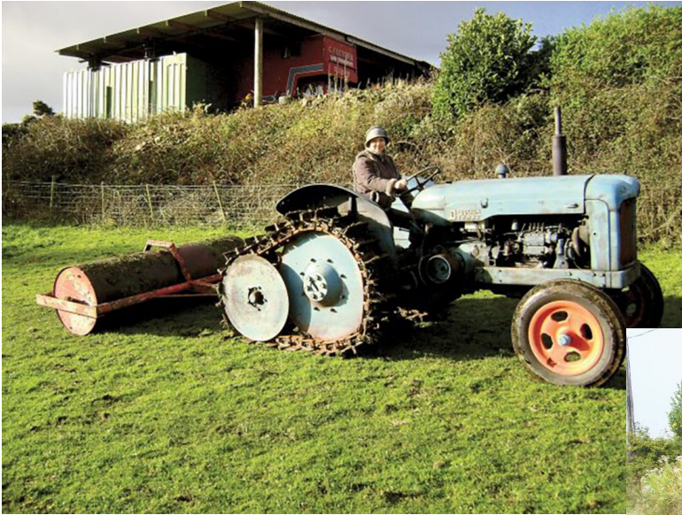
Unusual tractor with roadless half track conversion