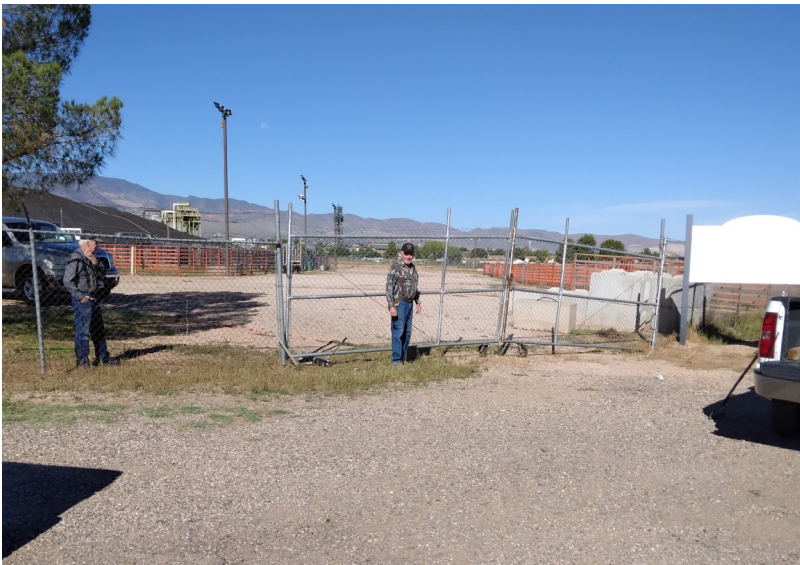
New Entrance photo

A major change in entering and exiting the Fair Grounds this year. As you enter off of the main road, Turn right beside the green Sports fields and you will see an entrance for our engine and tractor club members. Do NOT use the Main Entrance as we have in past years. This is very important.