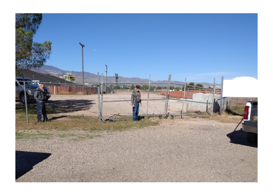
New Entrance photo

A major change in entering and exiting the Fair Grounds this year. As you enter off of the main road, Turn right beside the green Sports fields and you will see an entrance for our engine and tractor club members. Do NOT use the Main Entrance as we have in past years. This is very important.