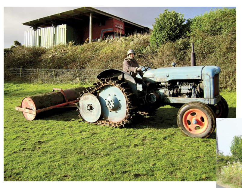
Unusual tractor with roadless half track conversion