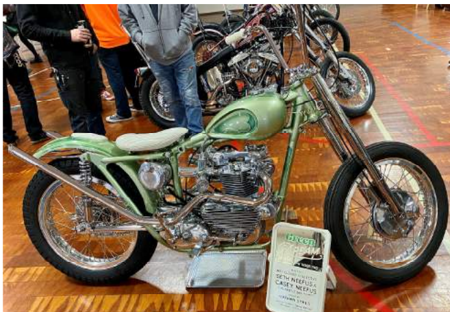
Best Foreign: 1957 Triumph Tiger T110