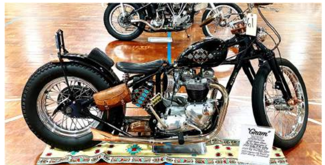
1963 Triumph Bonneville Bobber

Still, we all made it, and the sun came out for the load-in. Other folks came from Canada, Idaho, and, of course, the Washington locals.