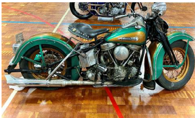
Best in Show: 1948 HD Panhead