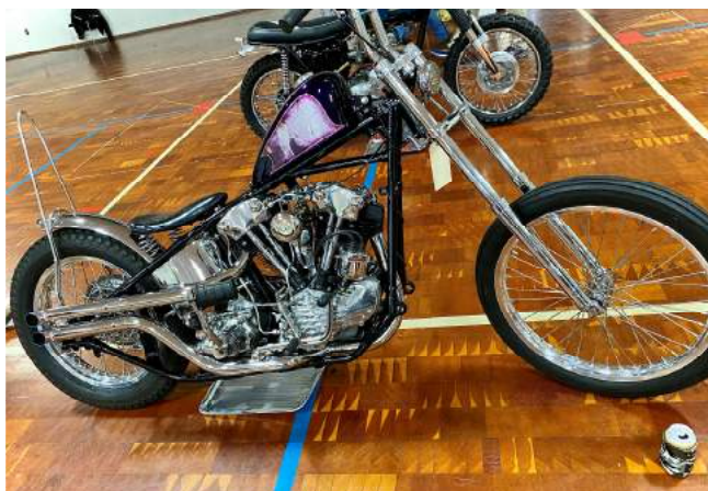
Best Chopper: 1946 HD Knucklehead

See you all out on the Open Road! Your Pal, Pod