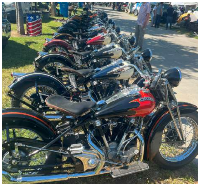
Crocker line-up at Dixon Fairgrounds, June 2023