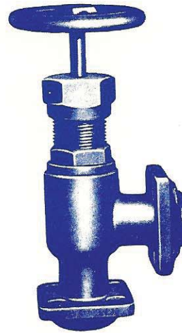
Valve Size: 1/2" - 1"