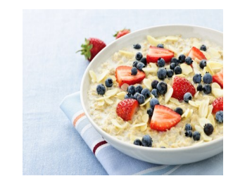
Rolled /Steel cut Oats