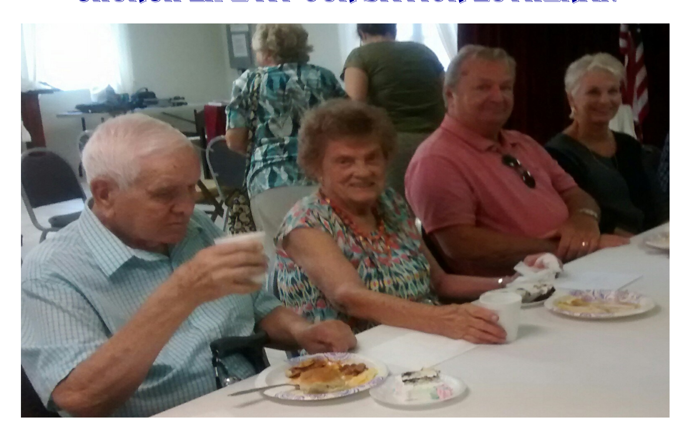
Enjoying a Pot Luck after a Sunday Service