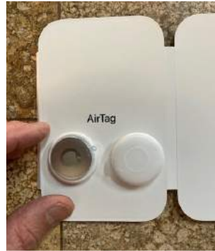
The Air Tag

Some people feel this is a little disturbing, the idea that other peoples' phones can boost the signal, but it is hidden to anybody else. Only the owner (the person originally activating the device) will get the location. It simply piggybacks on the boost signal. With the popularity of smart phones, you and your bike are nearly always near one, so the signal can be transmitted. The web has numerous articles on the product. There is also a version for Android called a Tile. So, for $25-$30 get one, get the smart phone APP, and try it out. It may just save your ride, or help you find your keys.