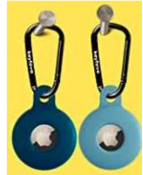
Air Tags in key fob holders