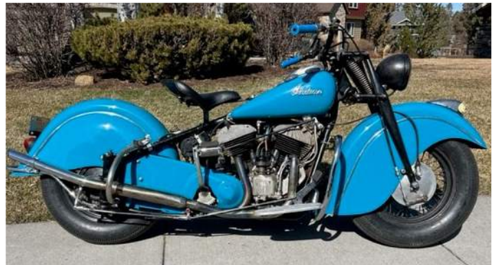
The 1948 Chief "After"