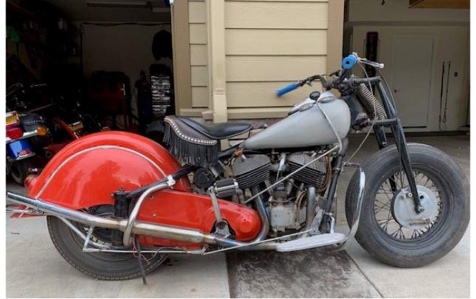
The 1948 Chief "Before"

I think it will be a good rider-quality bike at this point. Maybe next winter, a top end overhaul will be in order. It has been a fun 5-month project and fairly straightforward process. Having great aftermarket Indian parts available made it pretty easy overall.