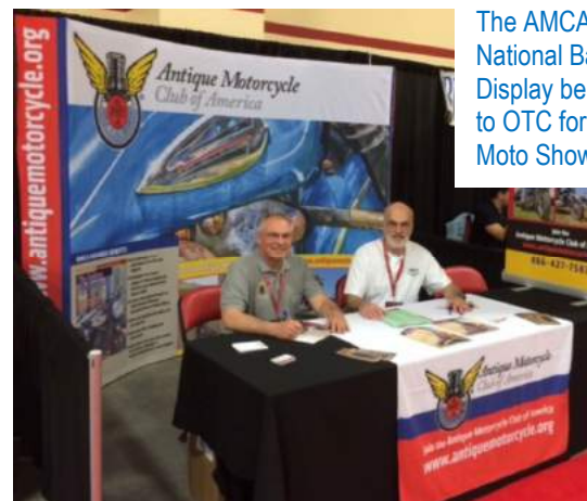
The AMCA National Backdrop Display being lent to OTC for One Moto Show.