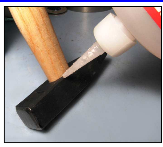
Applying Superglue to tighten the head to the handle.

Note that this is only a safe practice if the hammer head is just a little loose but is basically secured onto the handle. Gluing is not a fix for a hammer head that has come off the handle or is at risk of coming off.