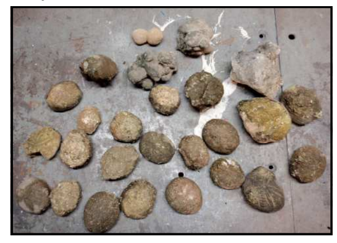
Fossil and other finds before cleaning.

We poked around the banks and looked over a few huge boulders that were unearthed by the dredging machines, in search of good quality, large-size echinoids. These are more than twice the size of the echinoids we find just off Hernando Beach and at the Vulcan Mine