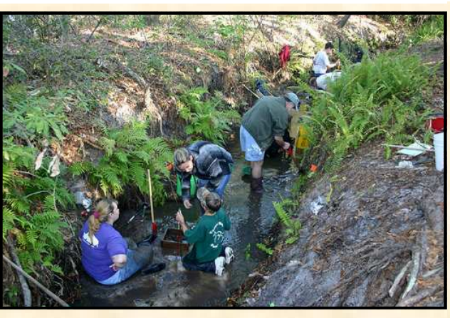
The Boca dig.

Last month I gave a program entitled "The Prehistoric Animals of Pinellas County. The Seminole Historical Society hosted the event on October 26. In 2007 I was involved in the identification of the fossil site at Boca Ceiga Millennium Park. This find led to the discovery of nearly 200,000 specimens and a Mammoth lower jaw. These fossils are on display at their fantastic museum and include the late Ice Age mammoth bones discovered in the park. My program can be viewed on utube.com on the Internet; the entire program is one and one-half hours in length. <a href="https://www.youtube.com/watch?v=Ghq_n780Rn8">https://www.youtube.com/watch?v=Ghq_n780Rn8</a>