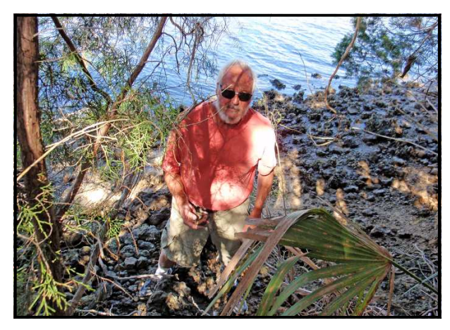
Collecting echinoids on the edge of the canal.

Walking the short distance from the parking area to the edge of the canal required passing through an area of brush, vines, overgrown palms, and cedars. Peg was quite uncomfortable because of the number of orb spiders and their webs and the black spiders with red legs that were running around. She also came across a black snake. There are alligator warning signs posted at the parking and picnic areas, so it's best to be on the lookout for all sorts of insects and critters.