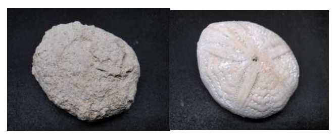
Echinoids before and after cleaning/

We found most echinoids toward the west end of the canal at these coordinates: 28° 59' 47.78" N, 82° 44' 01 94" W.