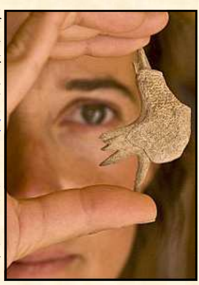
Soft shell turtle section

Dates are still open from January 14 through May 21.