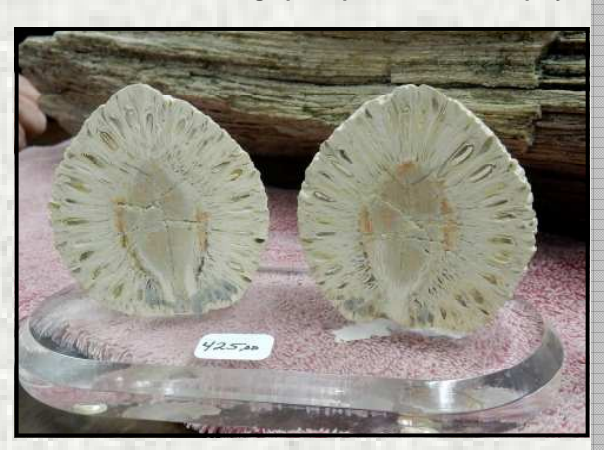
Patagonia fossilized pinecone.