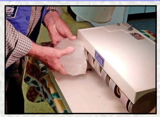
Rovie grinding and leveling a large quartz crystal.