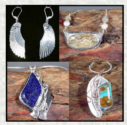
Examples of Melodye's jewelry.