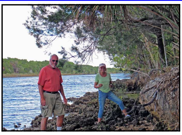
The constantly eroding bank exposes echinoids.

We walked and stumbled along the south edge of the canal near its western end, carefully looking at the constantly eroding bank that is made up of spoils dredged when the canal was dug several years ago.