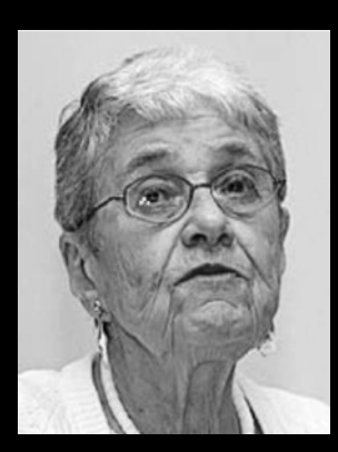
A 'cloud of witnesses.' See who and why »

Please support petition 21071: Aligning UM Investments with Resolutions on Israel/Palestine at General Conference 2012. Visit <a href="https://www.kairosresponse.org">www.kairosresponse.org</a> for more information about the petition and the issues discussed in this publication.