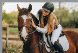
Young Equestrians APRIL 2026