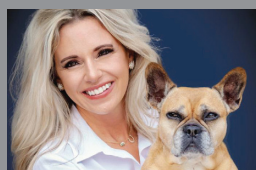
Our Wellington SEPTEMBER 2026