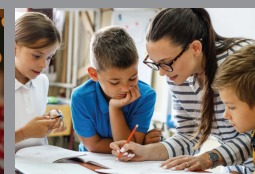
Education JUNE 2026