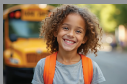
Back To School AUGUST 2026