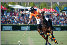
Faces Of Polo JANUARY 2026