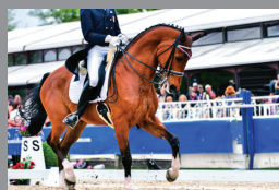
Faces Of Dressage MARCH 2026