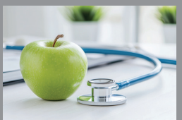
Health & Wellness JULY 2026