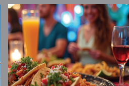
Holiday Flare DECEMBER 2026