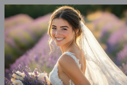
Palm Beach Brides OCTOBER 2025