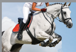
Faces Of WEF FEBRUARY