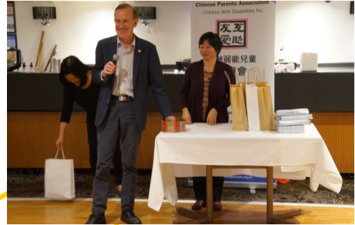
Moon Festival & Father's Day Celebration