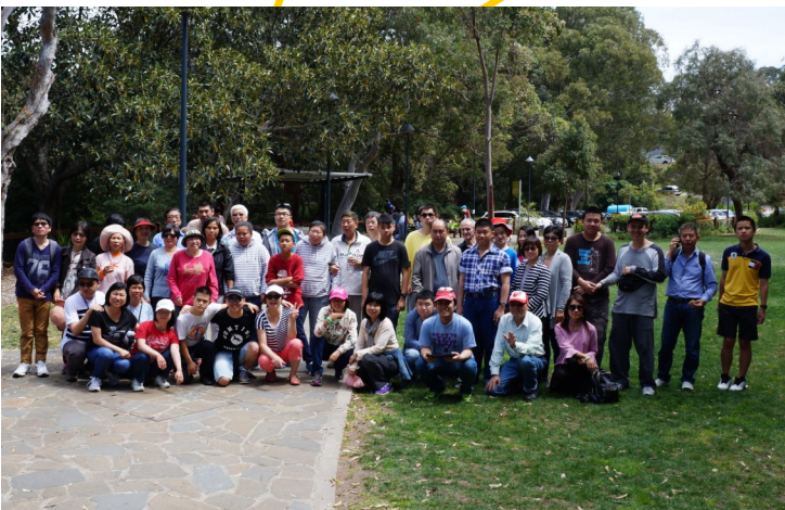
Picnic at Como