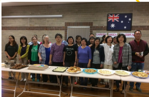
Carers Week Celebration