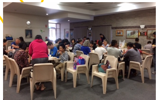
Carers Week Celebration