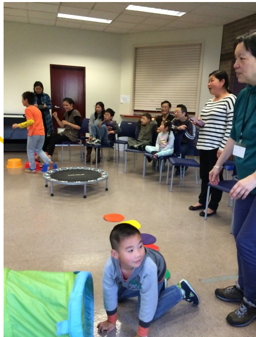
Junior Group Activities