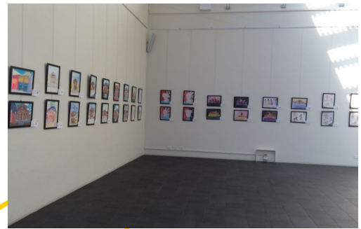
Kogarah Library Art exhibition