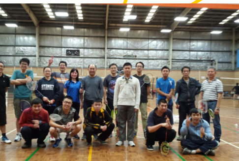
Badminton Session for Carers