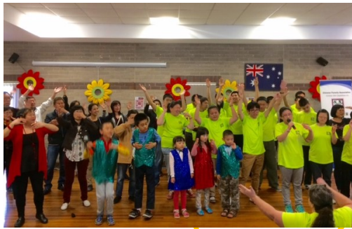
Grandparents day celebration