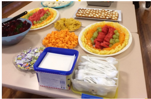
Grandparents day celebration