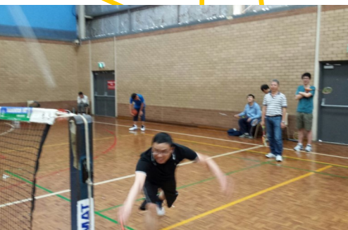
Badminton Session for Carers