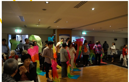
Moon Festival & Father's Day Celebration