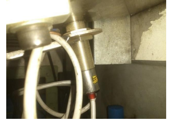
Fig.2 Inductive Proximity sensor

in the Fig.4 and implement all this components as per connection diagram in the company.