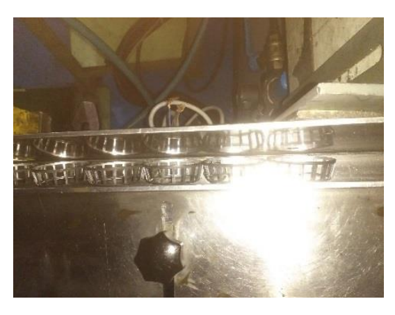
Fig.1 Bearings are stuck in Channel

Fig.1 shows the channel which is connected between the indexing machine and the coining machine. Through this channel the bearing cages are passes to coining machine after completion of the indexing operation. The one bearing cage is passes in 10 second through channel from indexing machine to coining machine. When the more number of bearing cages are passes through this channel from indexing machine to the coining machine the bearing cages are get stuck in that channel. Because of this when new bearing cage is loaded on the indexing machine for indexing operation the slots on that bearing cage gets marked wrongly by the indexing machine. Thus indexing machine is not able to make proper divisions of bearing cage. As the divisions gets marked wrongly, the quality of the bearing cages are affected. Due to which wastage/damage of the bearing cages are occurred and company is facing the rejection problem of this bearing cages. This reduces the production of the bearing cages. Also the quality of the bearing cages were gets affected. Because of this company facing the losses and it affected the production cost of the company. Therefor there is need of proper methodology used there to solve this problem.