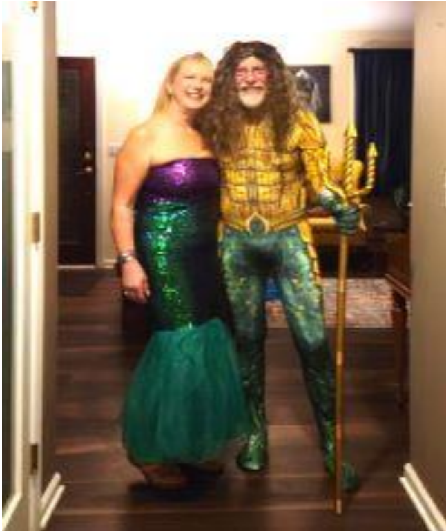
Either Neptune or Posidon on the right and a lovely mermaid on the left

For Halloween, a couple of our more adventurous members