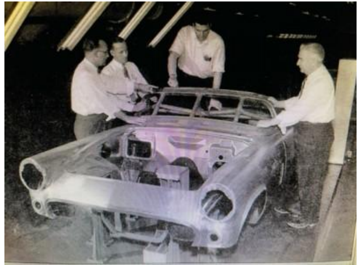
Engineers of the Budd Co. manufacturers of the 55-57 TBird bodies, going over prototypes.,

In case you are interested, 2/27 is National Fruit Cake Day