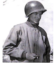
Ernie Pyle WWII Pulitzer Prize Reporter

WWII HISTORY & WARTIME STORIES for Everyone!