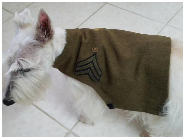
My dog Dorsey finds Blackout's army coat a bit small for him. The unit patch from the other side is shown below.