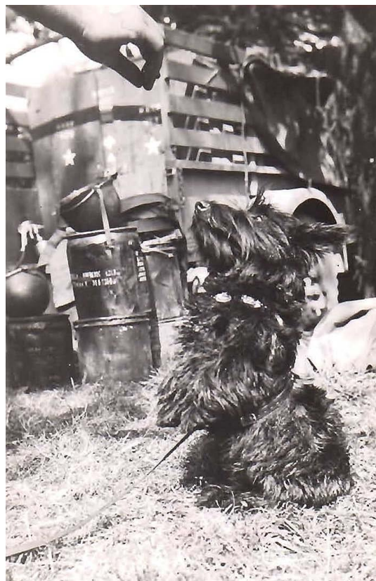
Blackout getting a treat somewhere in the European Theater

Attracted to Blackout, a 13 year-old boy and his 5 year-old sister from the town would make daily visits to see the dog. My Dad began to give the children food and candy and made them some small wooden toys. In 2008, my brother vacationed in the Netherlands and met those two children. The girl, then in her 70's, showed my brother those toys which she still treasured.