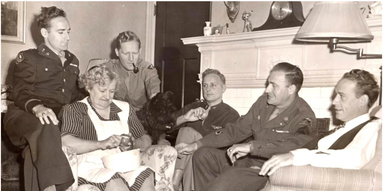
Blackout and the Hunter boys with Mother Hunter

All returned safely after the war – below is a picture that appeared in the Tulsa World newspaper of the boys with their mother and Blackout shortly after their return. My Dad is second from the right.