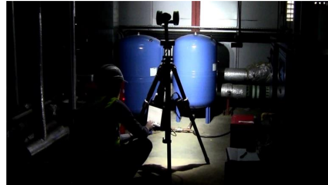
Industrial Plant area with low levels of lighting