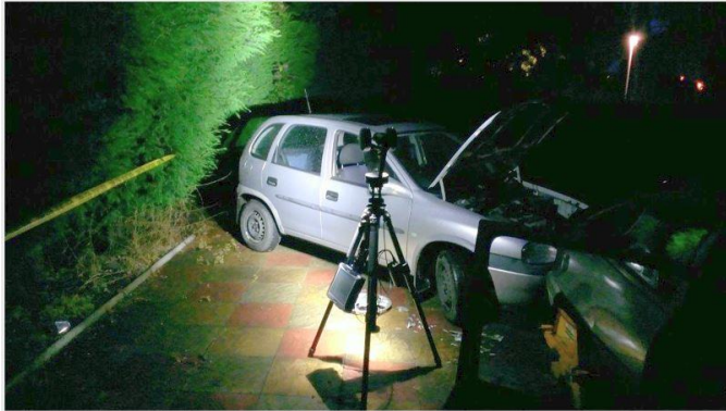
Night-time road traffic incidents