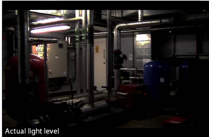
Actual light level