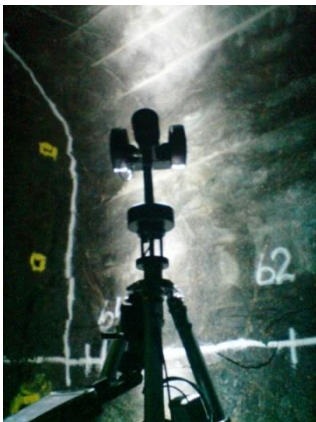
Mining - assisting Geologist's analysis