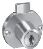
C8703 & C8705