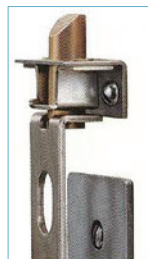
C9602 LATCH MECHANISM

Pushbutton cabinet locks offer convenience, security and safety for a variety of applications including, but not limited to cabinets, lockers, desk drawers, gun safes, wall safes, liquor cabinets, tool boxes and anywhere a cam lock is used.