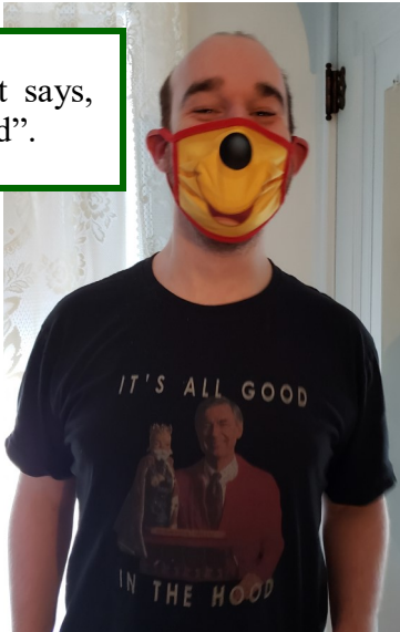
Austin - As the shirt says, "It's all good in the hood".