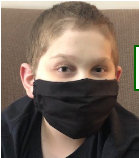
Riddick - Look out Johnny Cash, there's a new man in black in town.