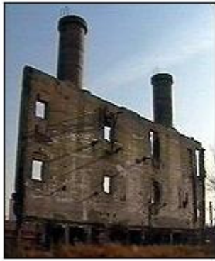
Remains of one of Unit 731's germ factories in Manchuria serve as a reminder of the atrocities that took place during Japan's occupation of China during World War II

General Willoughby and officials of MacArthur's Supreme Command for the Allied Powers in Tokyo had succeeded in suppressing evidence from Ishii and colleagues, but separate inquiries were made by the International Prosecution Section (IPS). Its lawyers gathered evidence including detailed statements from defecting Japanese bio-scientists from Pingfan. The latter testified to human live vivisection, the dumping of lethal germs in Chinese water supplies and food stores, as well as aerial spraying. Yet all was silenced even though the information went to the top.