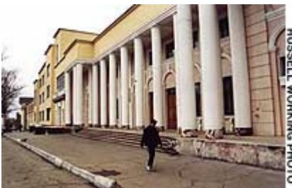
Site of the Khabarovsk Trial