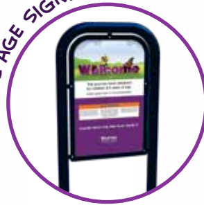
NU-2777 Save over $6,000!