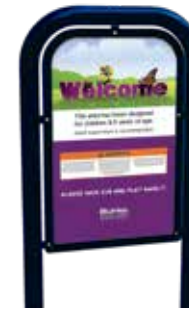
2-Sided Full Color Welcome Sign