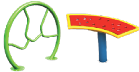
Novo Bike Rack and Arc Bench