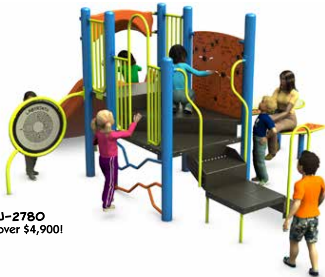
NU-2780 Save over $4,900!