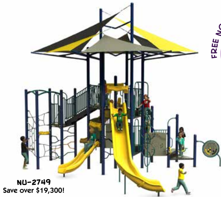
NU-2749 Save over $19,300!