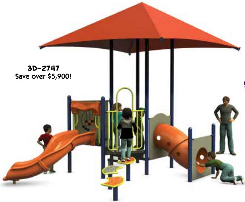
3D-2747 Save over $5,900!