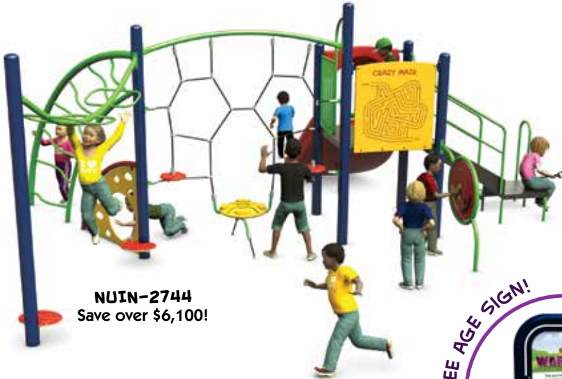
NUIN-2744 Save over $6,100!

3D-2746 SALE PRICE: $7,700* 3D-2747 SALE PRICE: $10,200* Ages 2-5 | 25 Kid Capacity | 26' x 23' ASTM Use Zone