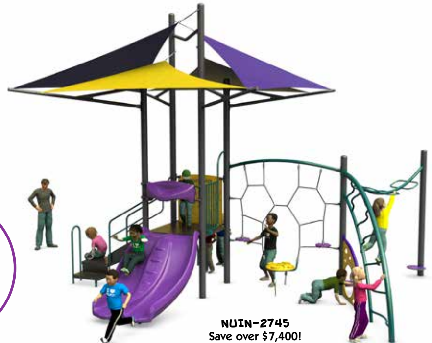
NUIN-2745 Save over $7,400!

NUIN-2744 SALE PRICE: $10,600* NUIN-2745 SALE PRICE: $15,600* Ages 5-12 | 44 Kid Capacity | 31' x 35' ASTM Use Zone