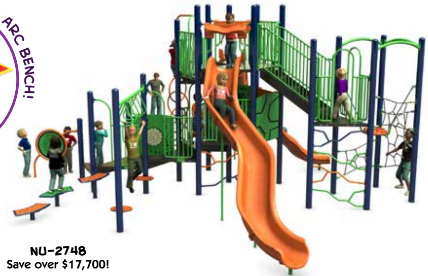
NU-2748 Save over $17,700!

NU-2748 SALE PRICE: $31,400* NU-2749 SALE PRICE: $38,700* Ages 5-12 | 89 Kid Capacity | 46' x 40' ASTM Use Zone