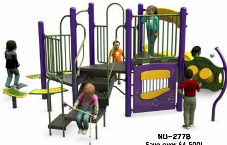
NU-2778 Save over $4,500!

NUIN-2775 SALE PRICE: $24,000* NUIN-2776 SALE PRICE: $19,200* Ages 5-12 | 57 Kid Capacity | 38' x 44' ASTM Use Zone