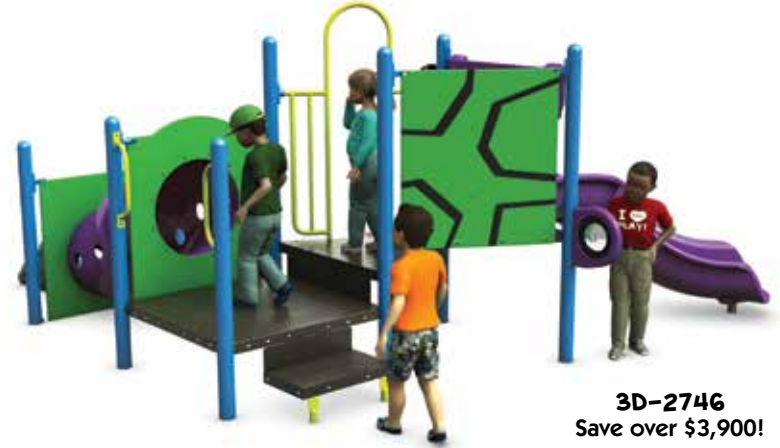
3D-2746 Save over $3,900!

3D-2746 SALE PRICE: $7,700* 3D-2747 SALE PRICE: $10,200* Ages 2-5 | 25 Kid Capacity | 26' x 23' ASTM Use Zone