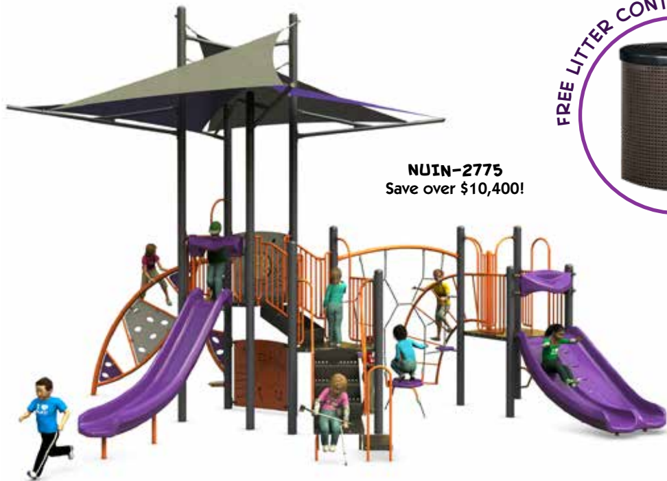
NUIN-2775 Save over $10,400!