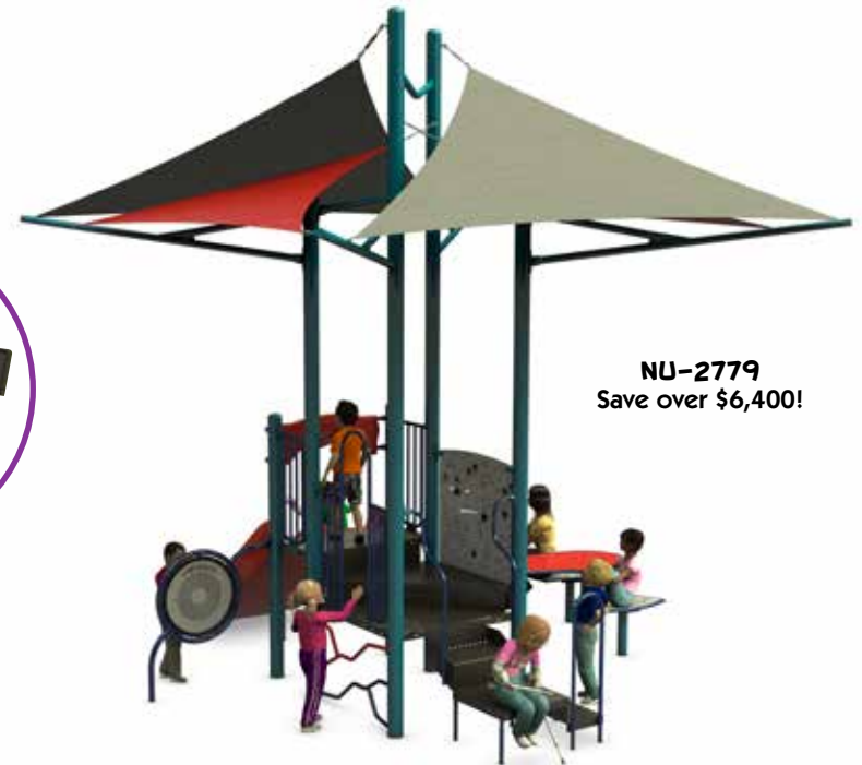
NU-2779 Save over $6,400!

NU-2779 SALE PRICE: $14,400* NU-2780 SALE PRICE: $9,500* Ages 2-5 | 32 Kid Capacity | 25' x 29' ASTM Use Zone