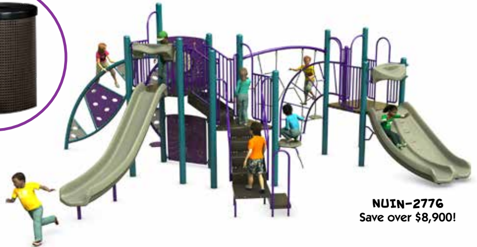
NUIN-2776 Save over $8,900!

NUIN-2775 SALE PRICE: $24,000* NUIN-2776 SALE PRICE: $19,200* Ages 5-12 | 57 Kid Capacity | 38' x 44' ASTM Use Zone