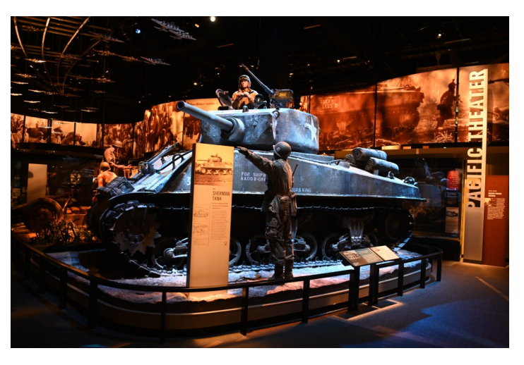
A Sherman tank from WW II. The tank was placed and the building built around it.