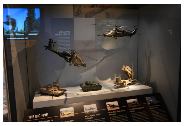
The big five Army weapons used in Desert Storm Operations; Abrams tank, AH-64 Apache attack helicopter, UH-80 Blackhawk helicopter, M23 Bradley fighting vehicle and the Patriot Air Defense system.