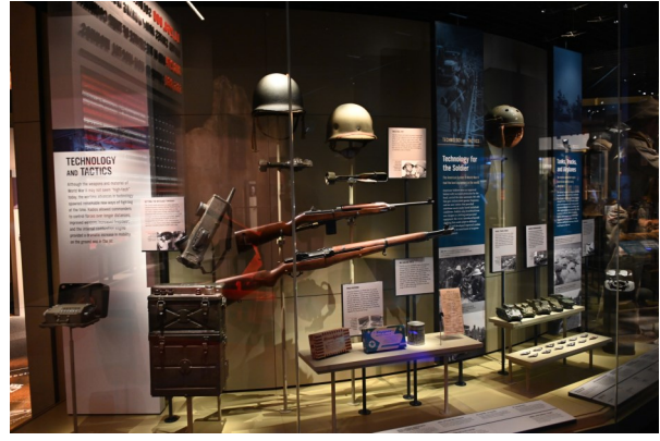
The walkie-talkie of WW II allowed commanders to communicate with their troops and control the battle. Also seen are field rations, moels of tanks and vehicles, and the faithful Gerry can.