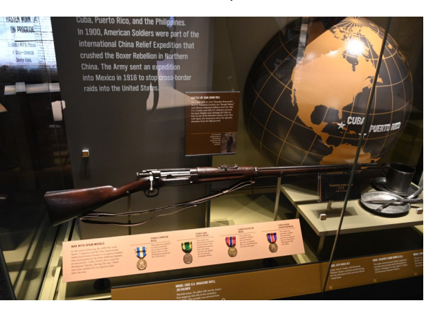
Model 1 892 US Magazine Rifle 30 cal, used in Cuba, Puerto Rico and the Philippines. Also displayed are medals from the Spanish-American War and Cuba/Puerto Rico occupation and various equipment.