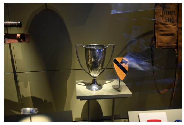
1st Cav cup and insignia