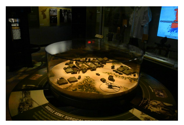
MASH 4077th in Korea? This and the H-13 helicopter changed the face of combat medicine and dropped the death rate of battle casualties below 10%.