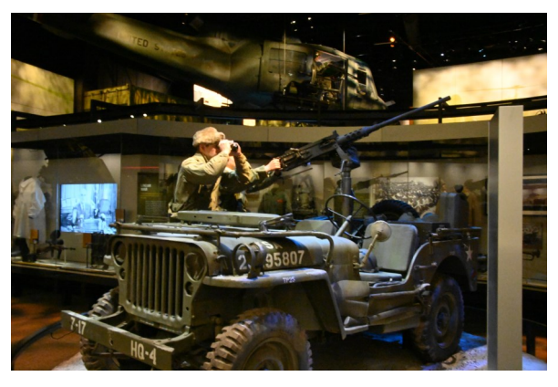
A jeep in Korea mounted with a 50 Cl machine gun. In the background hovers a Huey helicopter.