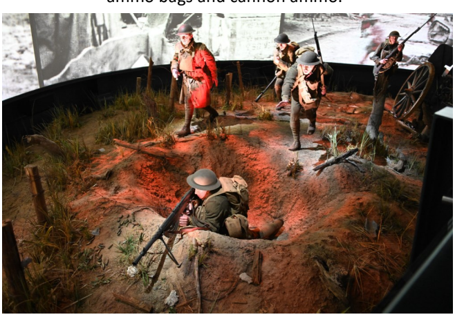
The battlefield of WWW I, the soldiers, their uniforms and weapons