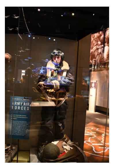
How the well dressed fighter pilot went "off into the wild blue yonder".