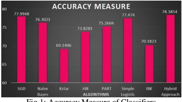
Fig.1: Accuracy Measure of Classifiers

The results obtained with the hybrid classifier of the proposed framework are the best among all classification algorithms, hence improves the accuracy and precision. The comparison among all classification technique is shown in Table.