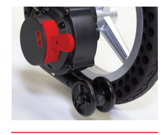
When powered off, freewheel (push) mode can be utilized and the wheels turn freely