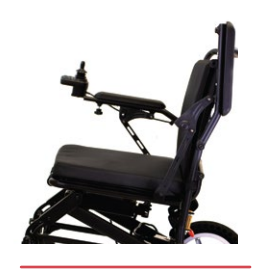
Flip up arm rests for a barrier-free side entry