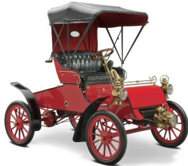
1903 Ford Model A Runabout

Did you know there's a historic connection between Cadillac and Henry Ford? Before he started today's Ford Motor Company, Henry started a car company called the Henry Ford Company in 1901 after his first attempt, The Detroit Automobile Company failed. Henry had this vision of building an inexpensive car for the masses. Up to this point automobiles were a plaything only for the wealthy. The investors didn't share Henry's vision and he left the company in 1902. The company re-organized itself and changed the name to Cadillac. It continued the pursuit of building a car for the wealthy, not the masses, and became part of the fledgling General Motors Corporation in 1909. Cadillac continues as General Motors' flagship brand to this day. It is interesting that the early Cadillacs were nearly identical to Ford's 1903 Model A, except with a different engine.