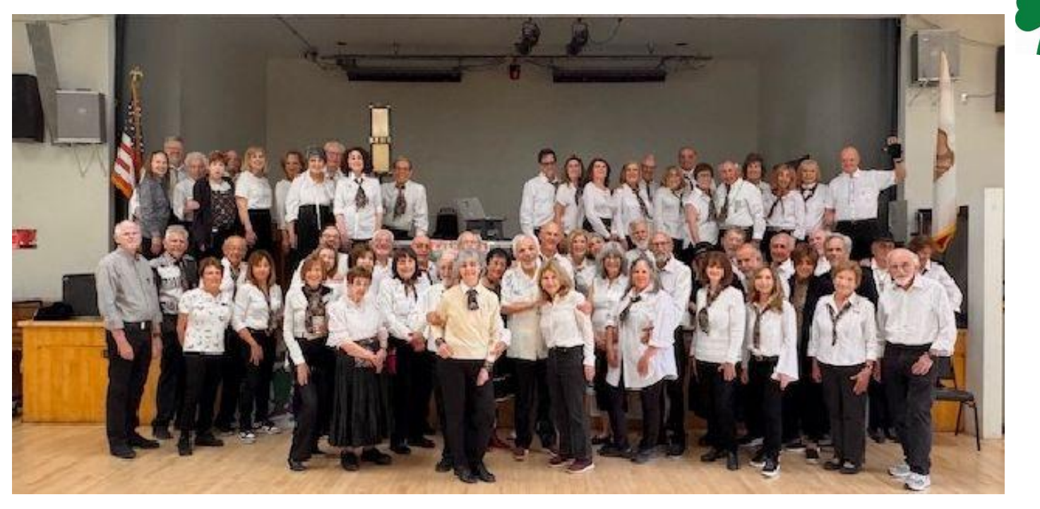
60 Trail & Rail Dusters attended the March 16<sup>th</sup> dance!

NOW LET'S GO TO THE SHAMROCKS & SHENANIGANS DANCE