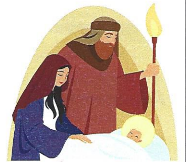
Wesołych Świąt Bożego Narodzenia

Classes will resume on Wed January 7, 2015