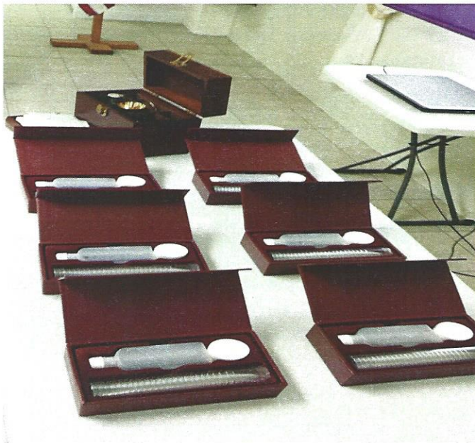
Above: Communion Kits for the new ministers