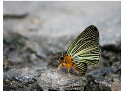
Fig.2: Burara gomata gomata , Sankhuwasabha dist, Nepal (1175m).