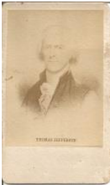
Thomas Jefferson (1743-1826)

Thomas Jefferson's political philosophy will dominate the American scene over the next four decades.