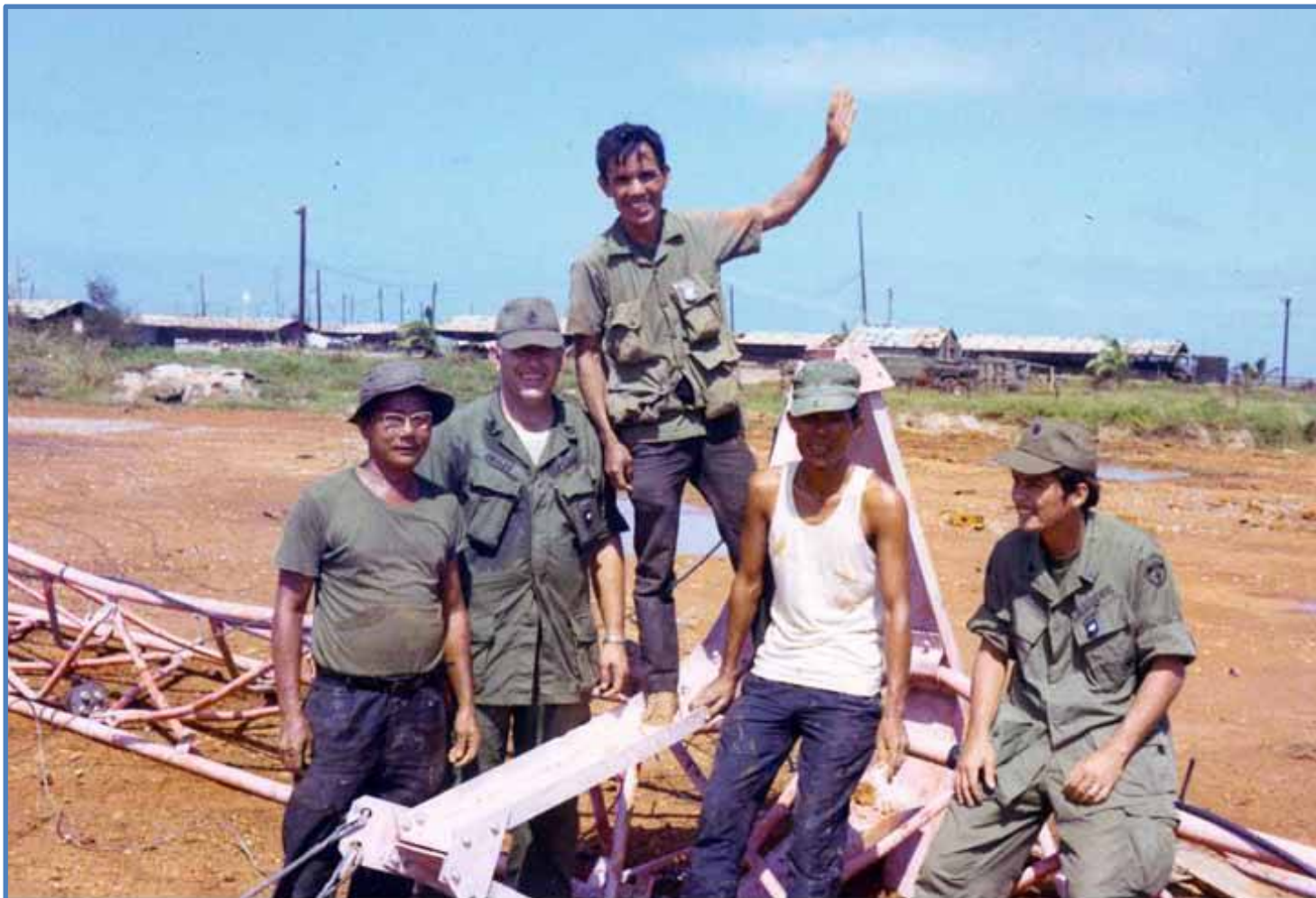
With some of the AFVN "local hire" tower crew taking down the Chu Lai tower.