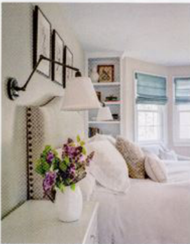
Fresh, fun-free white bedding, custom throw pillows and a sconce-style lighting with articulated arms make Ford's master bedroom the perfect place for family snuggles and curling up with a good book.

Elza B. Design | Acton, Mass. 1018-855-7817 | ElzaBDesign.com