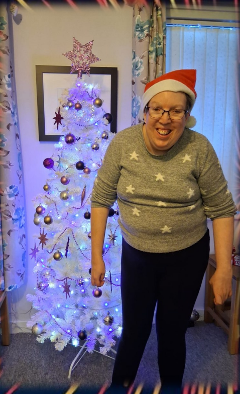
Sam's beautiful Christmas tree.