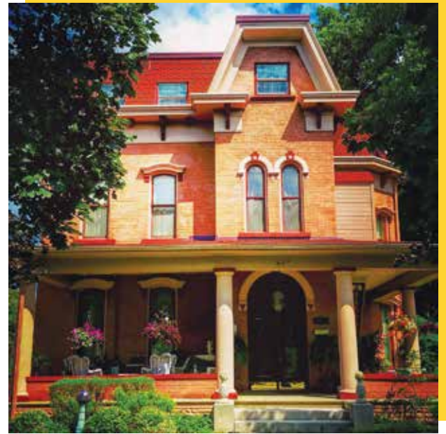
Magnolia Manor Bed and Breakfast and Tea Room

To make reservations, call Marlena Allen at 330-204-2477.