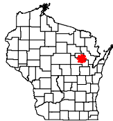
Project Location in Wisconsin