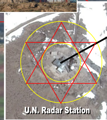
U.N. Radar Station